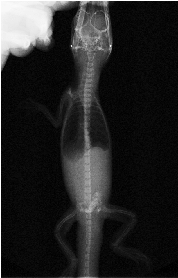
Fig. 2. Radiograph plate of the malformed crocodile Crocodylus moreletii captured in Río Hondo, Quintana Roo, Mexico. Note the absence of the shoulder bones (i.e. coracoid and scapula). White arrow = 30.7 mm

not mutilation. This case is the first report of forelimb agenesis in crocodylians in Mexico and the third case in C. moreletii in the southern Yucatan Peninsula after those reported in Belize by Rainwater et al. (1999). This is the first observation of such an abnormality among the 286 individuals of C. moreletii captured in Río Hondo to date (J. R. Cedeño-Vázquez pers. comm.). Our prevalence rate (0.35%) is similar to that reported by Rainwater et al. (1999) (0.31%).